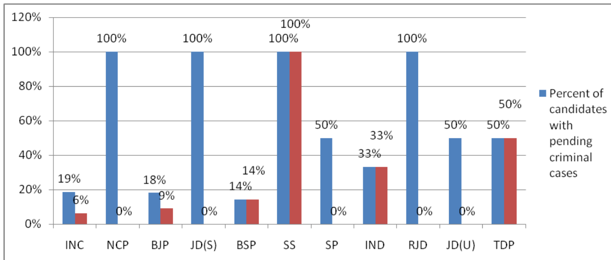
Figure: Comparison of pending criminal cases and serious pending criminal cases for candidates for major Party