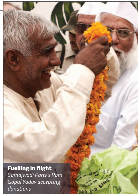
Fuelling in flight Samajwadi Party's Ram Gopal Yadav accepting donations

Informed sources told TEHELKA that an estimated Rs 10-15,000 crores ($2-3 billion) has been earmarked by political parties for "unofficial" purchases of individual votes. Besides this, politicians —