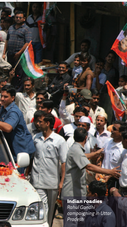
Indian roadies Rahul Gandhi campaigning in Uttar Pradesh